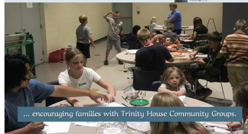
... encouraging families with Trinity House Community Groups.

The mission of the Trinity House Community is to inspire families to make home a taste of heaven for the renewal of faith & culture.