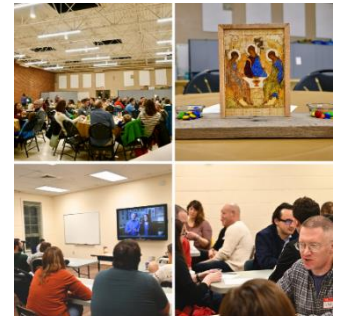
Trinity House Community's Heaven in Your Home Gatherings

Whether you work in Marriage and Family Life, Catechetics, Catholic Schools, or at a Parish, you know families need formation and support to live out the faith at home. We would like to partner with you—using a visionary and practical model for family life, the Trinity House Way—to help meet that need!